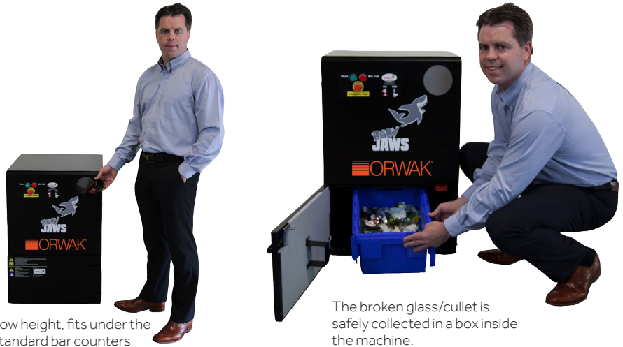
Low height, fits under the standard bar counters

It dramatically reduces the labor cost associated with managing waste bottles, the frequency of glass collections required and the overall waste glass disposal costs for your business.